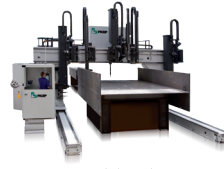
CNC Gantry Drilling Lines