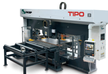
CNC Punching, Marking and Thermal Cutting Systems