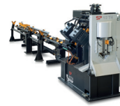
CNC Punching and Shearing Lines