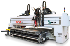
CNC Drilling, Marking and Thermal Cutting Systems