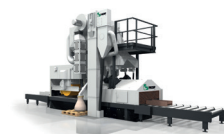
Surface Treatment Systems