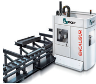
Single Spindle CNC Horizontal Drilling Lines