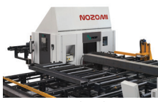
CNC 9 Axes Coping Lines