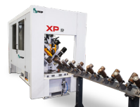
CNC Punching, Drilling, Marking and Shearing Lines