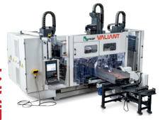
Three Spindle CNC Profile Processing Lines