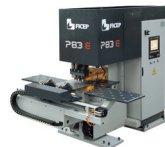
CNC Punching, Drilling and Marking Systems