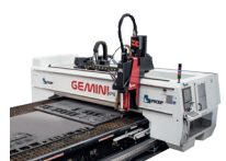
CNC Drilling, Milling and Thermal Cutting Systems