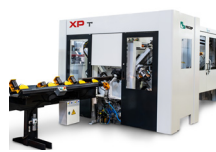
High Performance CNC Punching and Shearing Lines