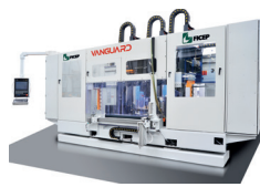
Three Spindle CNC Profile Processing Lines