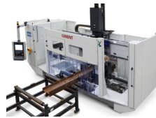
Single Spindle CNC Profile Processing Lines