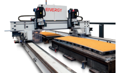
CNC Plate Edge Milling, Scribing and Marking Systems