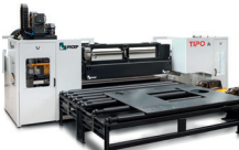
CNC Drilling, Marking and Thermal Cutting Systems