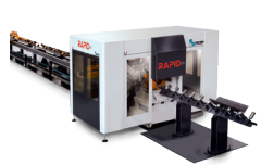
CNC Drilling, Marking and Cutting Lines