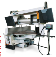
Band Sawing Lines