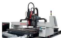
CNC Drilling and Thermal Cutting Systems