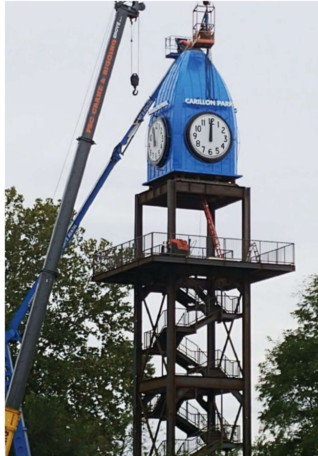
The historic Callahan Clock was built in 1892 and originally located atop Dayton's first skyscraper. The clock was preserved when the building was razed and is now installed atop the Brethen Tower in the city's Carillon Park.

Opened to the public in late 2018, the interactive and interpretive tower features panels that educate visitors about