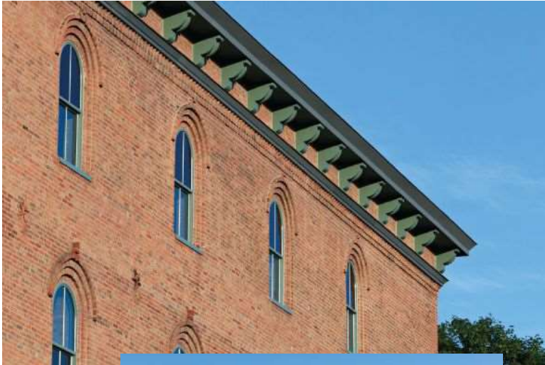
Restoration of the Cerealine Building in Columbus, Ind., built in 1880, transformed the historic structure from an old, dilapidated factory into a beautiful, modern conference center.