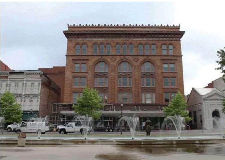
The 150,000-square-foot Bushnell Building in Springfield, Ohio, is among the 95,000-plus structures on the National Register of Historic Places. The building was completely renovated and modernized, earning LEED certification.

demolition materials were recycled. Construction waste was either recycled or diverted from landfills.