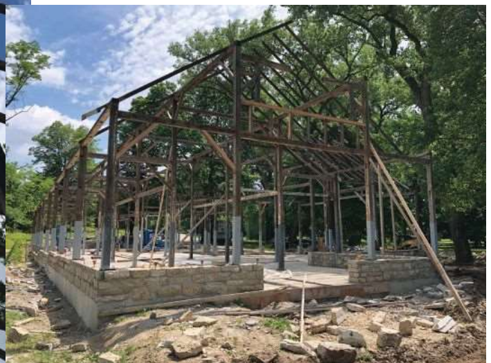
Built in 1901 and located on the original Montgomery County Fairgrounds in Dayton, Ohio, Barn No. 17 has been completely disassembled and rebuilt a little more than a mile away at its new location in Carillon Historical Park.